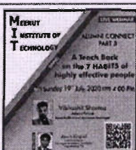
A Teach Back on 7 Habits of Highly Effective People.jpg 71K